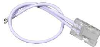
8mm Snap-On LED Strip Connector