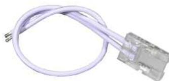
8mm Snap-On LED Strip Connector