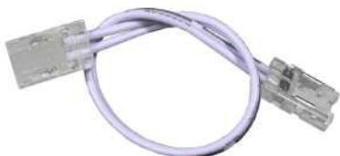
8mm Snap-On LED Strip Joiner